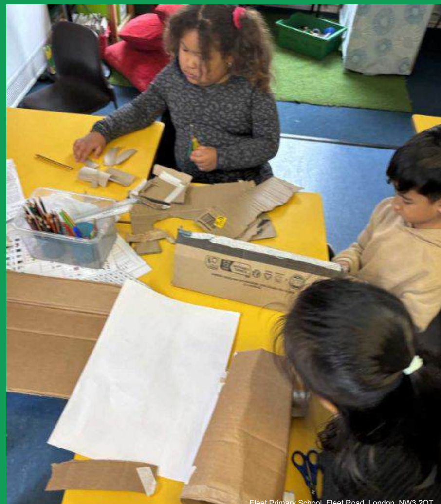
Fleet Primary School, Fleet Road, London. NW3 2QT