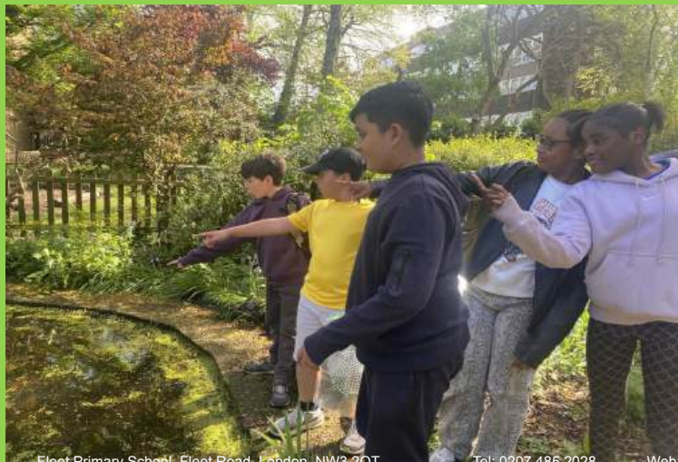
Fleet Primary School, Fleet Road, London. NW3 2QT