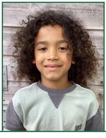
Star of the Week