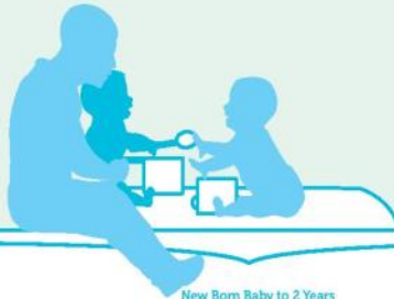
New Born Baby to 2 Years