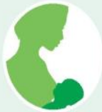
Pregnancy & New Born Baby