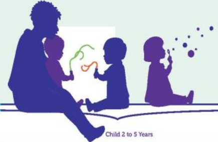
Child 2 to 5 Years