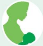
Pregnancy & New Born Baby