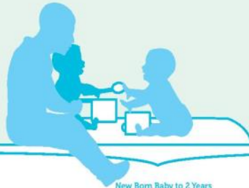
New Born Baby to 2 Years