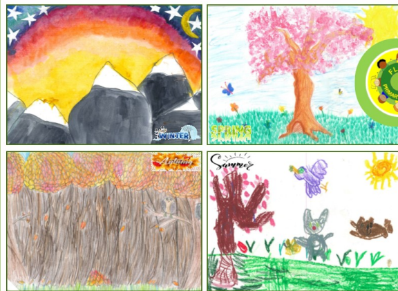
Fleet Primary School 'Seasons of the Year' Calendar 2020

The Fleet Calendar is now finished—fresh with some of the amazing entries from the 'Winter' theme which closed today. It has some absolutely beautiful artwork in it and would make a great addition to any wall (and a brilliant Christmas present or New Year gift!). We will have some samples available after school on Monday for you to look at and place an order. It is very reasonably priced at £3.50 a calendar—all proceeds go to support the school. All orders will be ready to collect before the end of term.