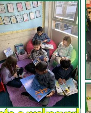
ear 3 Book Comer gets a makeover

Year 1 enjoyed a Road Safety Drama Workshop, which involved them making their own Road Safety film and then walking the Red Carpet! They not only learned about how to safely cross the road but they got to watch their Star Turns in the film at the end of the day!