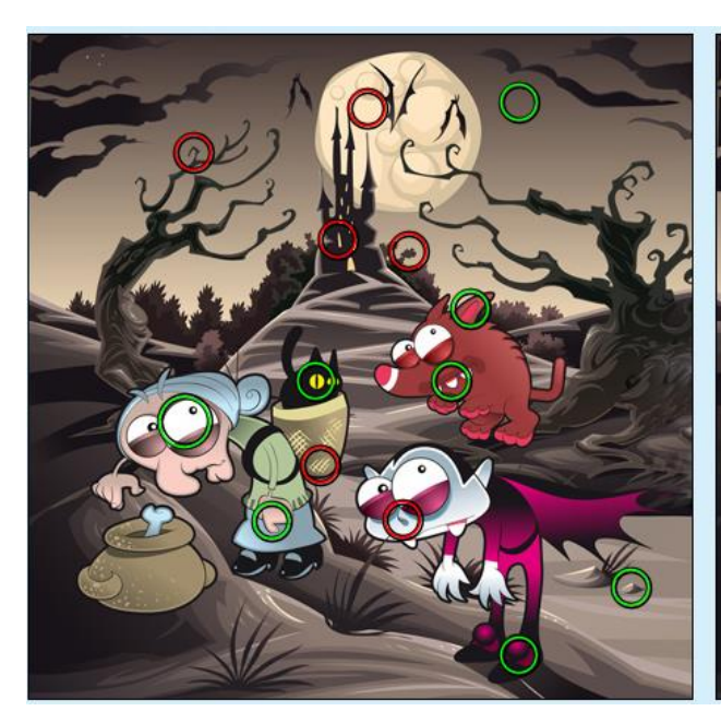
Spot the difference