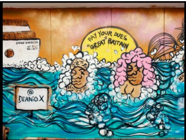
PAY YOUR DUES GREAT BRITAIN.