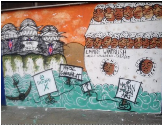
FROM AFRICA TO THE CARIBBEAN TO CATFORD - A GREAT BRITISH SC...

generation OR imagine you were onboard HMT Windrush, write a postcard to a family member back in Jamaica telling them what your life is like in Britain.