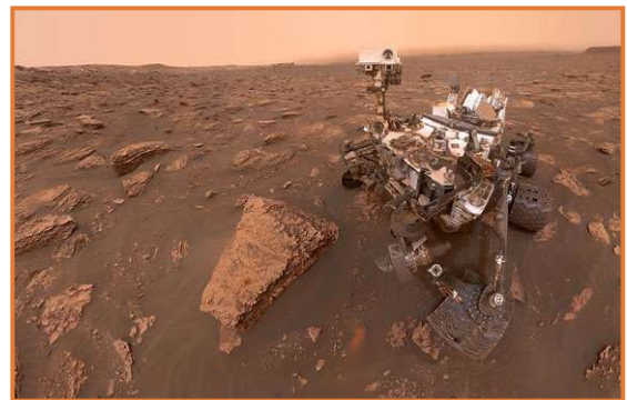
A self-portrait taken by NASA's Curiosity rover.

radiation – Energy emitted by the Sun, some of which is dangerous to humans when not absorbed by the atmosphere of a planet.