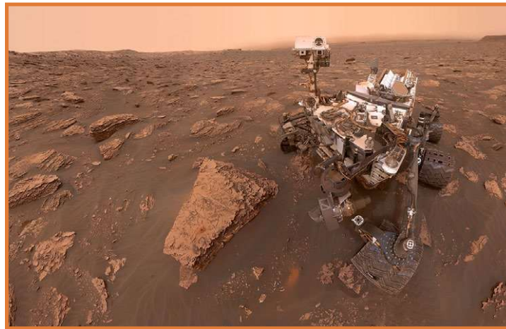
A self-portrait taken by NASA's Curiosity rover.

Read the KS2 Twinkl Originals story ' Jazz Harper: Space Explorer ' to learn all about life on Mars!