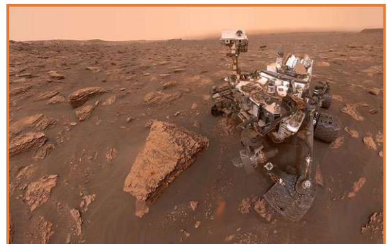
A self-portrait taken by NASA's Curiosity rover.

radiation – Energy emitted by the Sun, some of which is dangerous to humans when not absorbed by the atmosphere of a planet.