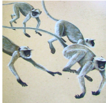
Scene 2: Monkeys run down the mountain, through the plantation, frightening the women.