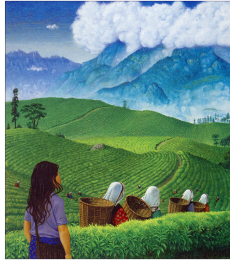
Scene 1: Women begin work, calm and quiet. Monkeys awake in the misty mountains at sunrise.

We are going to write a description of the monkeys running down from the mountains, conveying the change in atmosphere. Today mind-mapping words and phrases.