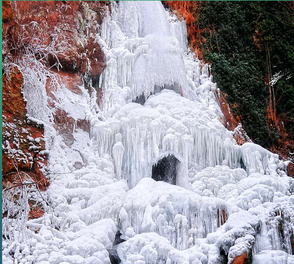
Nideck Falls, France. In the icy depths of winter, the cascading waterfall freezes to make these icicles.