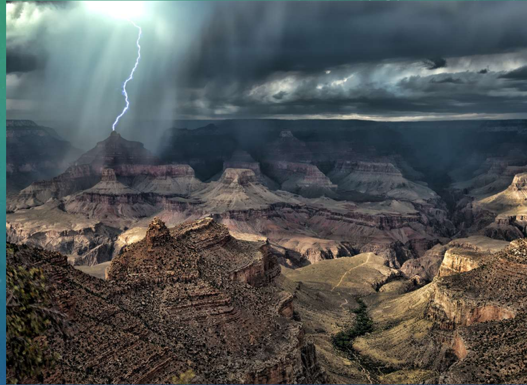
Grand Canyon, USA. At some points, the canyon reaches depths of up to a mile!