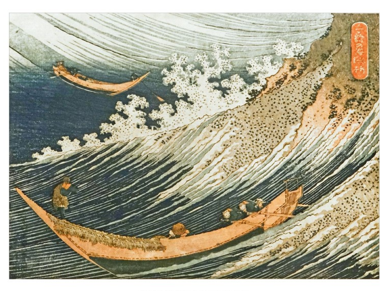
Choshi in the Province of Chima by Katsushika Hokusai