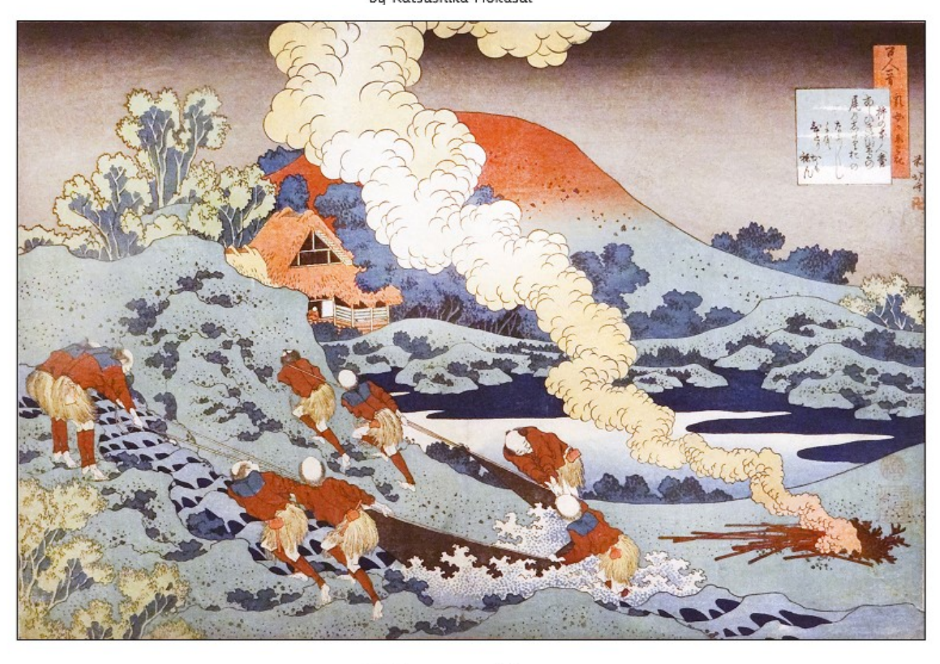
Kakinomoto no Hitomaro by Katsushika Hokusai