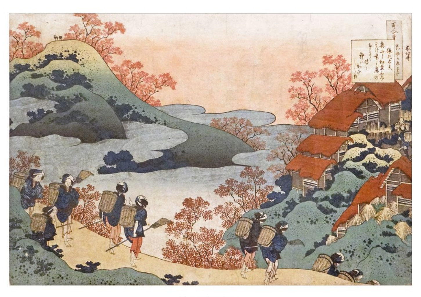
Sarumaru Daiyû bu Katsushika Hokusai