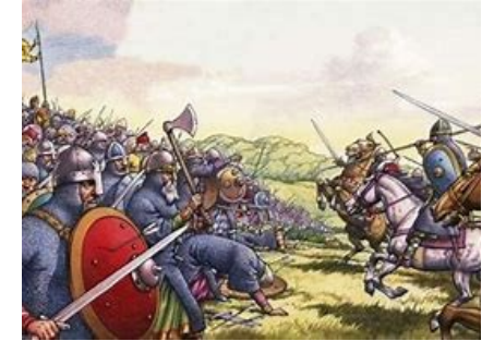
Decline of the Vikings