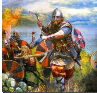
Raiders and Invaders