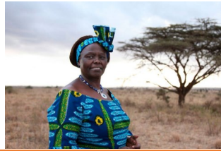
Wangari Maathai (1940-2011)

The last Tudor queen and one of the longest ruling monarchs.