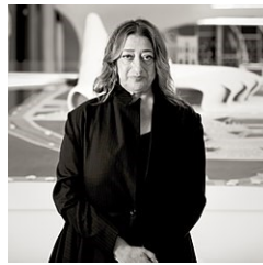
Zaha Hadid (1950-2016)

A Victorian author, who wrote A Christmas Carol and Oliver Twist amongst other novels.