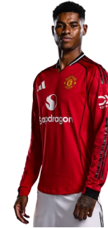
Marcus Rashford (1997)

An architect, known for designing buildings with curved shapes.