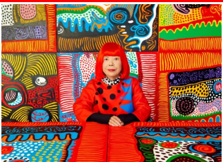
Yayoi Kusama (1927)

An explorer who went on voyages to the Arctic.