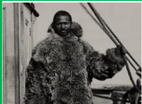
Matthew Henson (1866-1955)

A physician (medical doctor), and the first woman to earn a medical degree in the United States.