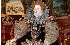
Elizabeth I (1533-1603)

The last Tudor queen and one of the longest ruling monarchs.