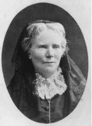
Elizabeth Blackwell (1821-1910)

A physician (medical doctor), and the first woman to earn a medical degree in the United States.