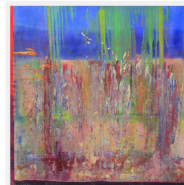
Abstract Expressionism (1940's-1950's)