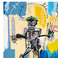
Neo Expressionism (1980's)