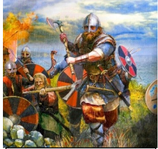
Raiders and Invaders