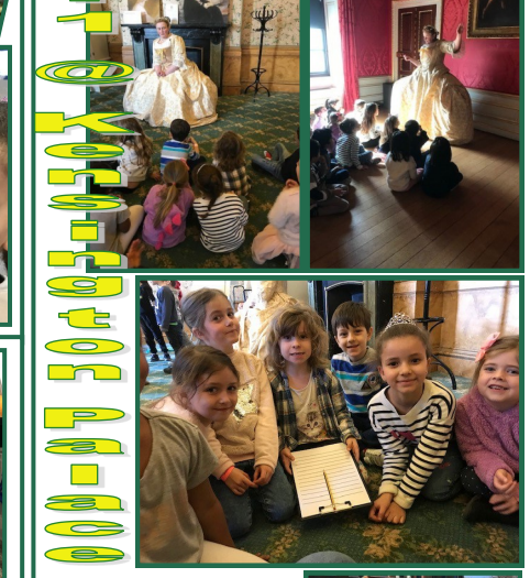
Year 1 had a fabulous time at Kensington Palace this week spending the day with 'Princess Caroline'! A huge thank you to the parents who came along to help out. Much appreciated.