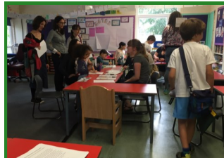
Home Learning Drop in

We also had the home learning drop in this week after school on Wednesday—the teachers did a great job of preparing simple tasks that could be done at home. It was great to see so many parents keen to learn how they could support the children's learning in fun and imaginative ways. If you didn't manage to make it there are some hand outs in the entrance area with ideas and ask the teachers, they will be happy to fill you in.