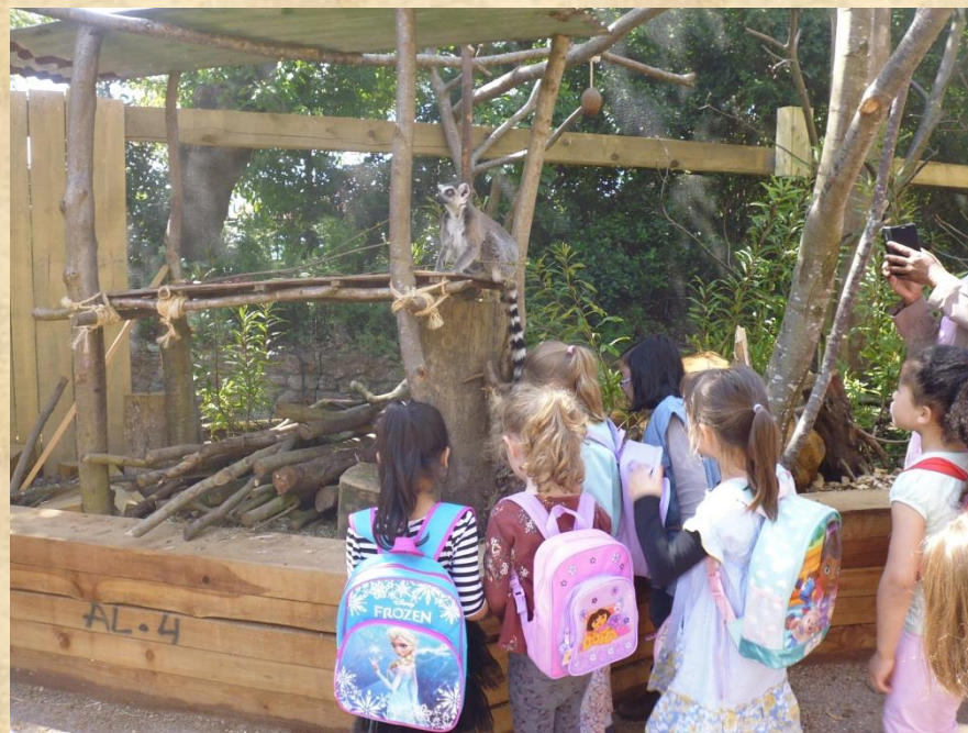
A trip to London Zoo

For our outings, children may require a packed lunch. These should include no glass bottles, fizzy drinks, sweets, chocolate or nuts. Trips are a very important part of our provision and we encourage all children to attend.