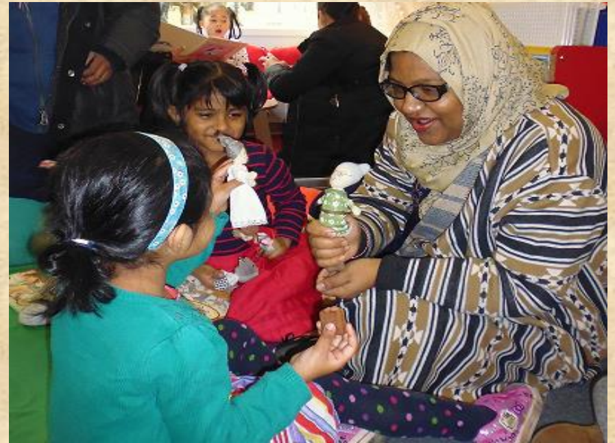
Parent Reading Morning

At Fleet we encourage parents to be active participants in school life and have a number of school events, class teas and workshops throughout the year.