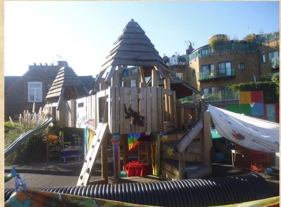
Nursery Outdoor Area

The outside area is open all year round, in all types of weather with shelters to protect from the elements. The outside areas offer unique opportunities to develop social and linguistic skills for getting on with others, (e.g. learning to share, taking turns etc) and for learning on a larger scale than is possible inside. There are large scale climbing structures that offer challenge for the children's physical development and role play opportunities.