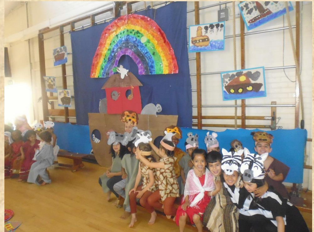
Reception's Noah's Ark Assembly

Some of the exciting events you are welcome to attend through the year are International Food Evening where everyone brings a dish to share, music assemblies, curriculum evenings, the school disco and our lovely Christmas and summer fairs. Each class also holds a class tea each term. Parents and carers donate delicious cakes, biscuits and snacks and help sell these after school. Class teas take place on Thursdays in the hall and are a great way to get to know the school community. Money raised from the teas goes towards funding class trips. Reception also perform a class assembly in the summer term.