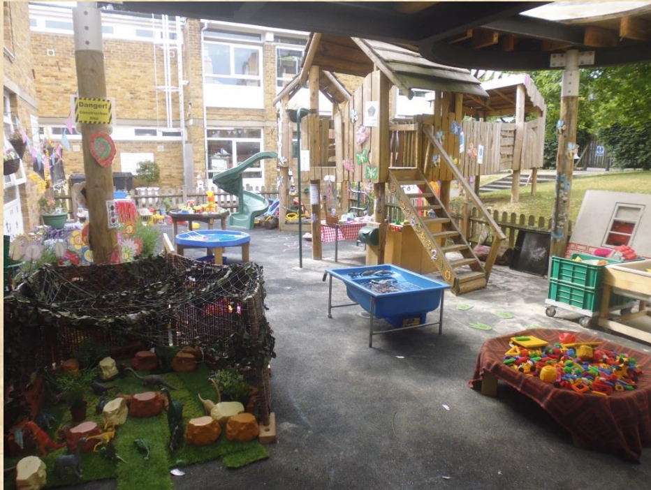
Reception Outdoor Area

The children can choose to go outside at regular times throughout the day. Children have free access to all areas and will be encouraged to be as independent as possible. Adults will be on hand to support children in their play and learning and lead specific activities inside and out.