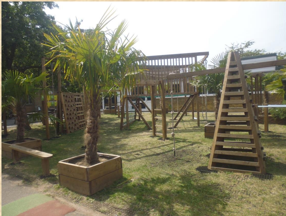
The Infant Playground

12.15 - The children are collected for lunch by one of our lovely lunchtime supervisors. In the hall the children are supported when choosing their lunch and carrying it to their table where they can eat with their friends before going into the Infant playground to play and explore the climbing equipment.